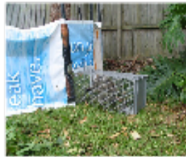
Princess's Capture